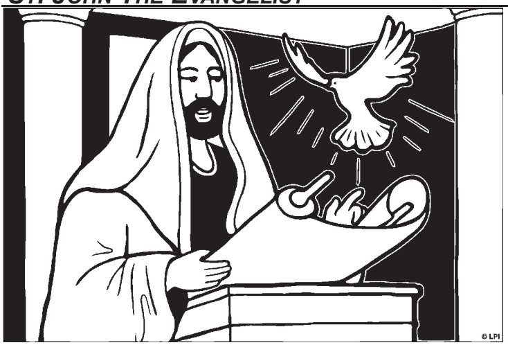
"The Spirit of the Lord is upon me...He has sent me to proclaim liberty to captives and recovery of sight to the blind, to let the oppressed go free."- Lk 4:18

Readings for NEXT Sunday, January 31, 2016: Jer 1:4-5, 17-19/ Ps 71:1-6, 15-17/ 1Cor 13:4-13/ Lk 4:21-30